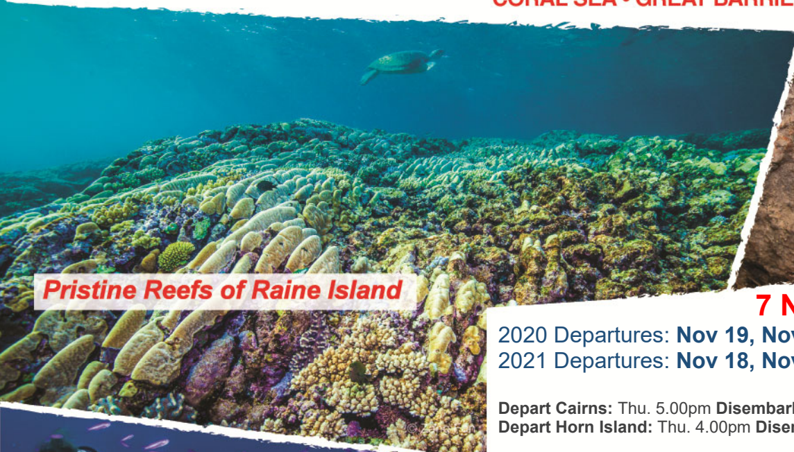
Pristine Reefs of Raine Island

CORAL SEA • GREAT BARRIER REEF • AUSTRALIA