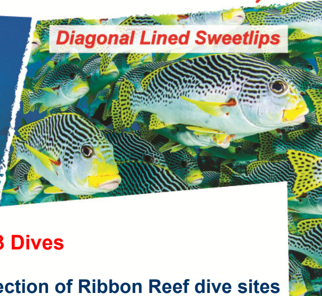
Diagonal Lined Sweetlips