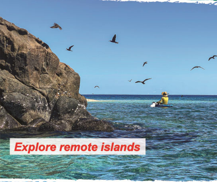
Explore remote islands