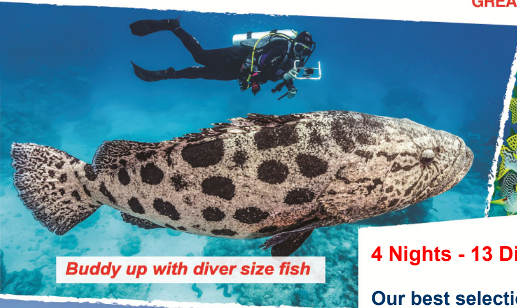
Buddy up with diver size fish