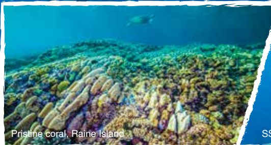
Pristine coral, Raine Island