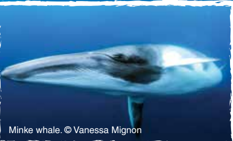
Minke whale.