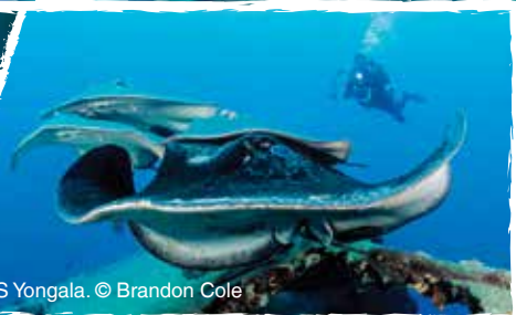
SS Yongala.